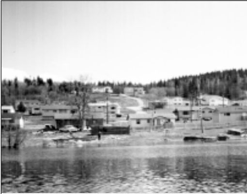
(Fort Babine, B.C. on Babine Lake)