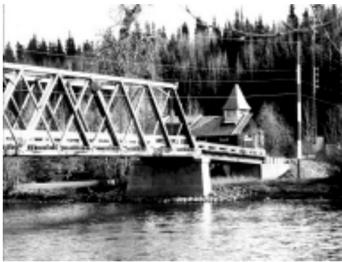
(Bridge over the Bulkley River at Quick, BC)